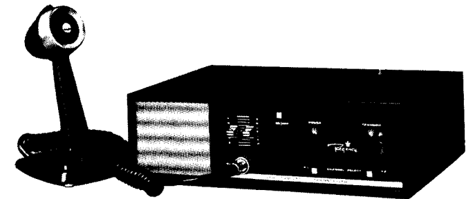
MODEL BTH-201B and BTH-202B